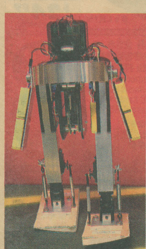
WALK THIS WAY A kneehigh robot designed at M.I.T. was one of three unveiled last week that walk far more naturally.

Modern versions of the machines, called passivedynamic walkers, have been built for decades and